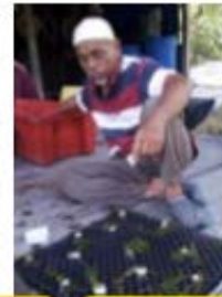
Penanaman Rumpai Laut