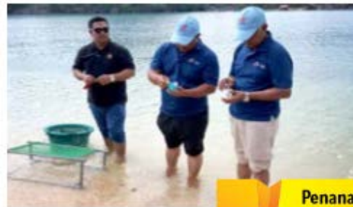
Penanaman Batu Karang