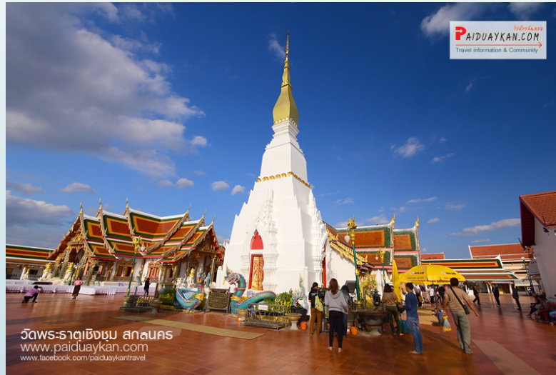
Cheng Chum Pagoda