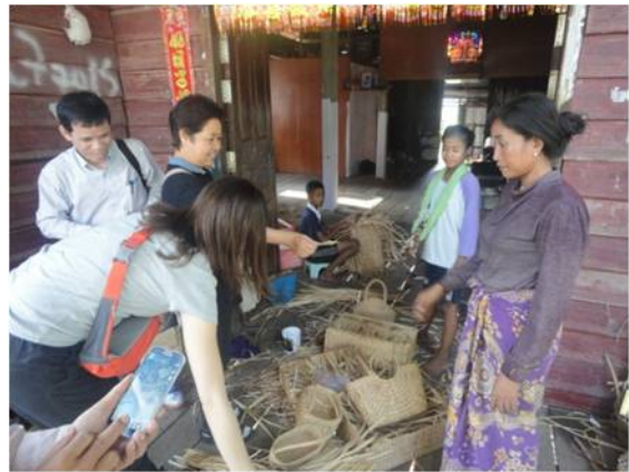
Fig. 4 Site visit at Tonle Sap Lake and water hyacinth handicraft women group