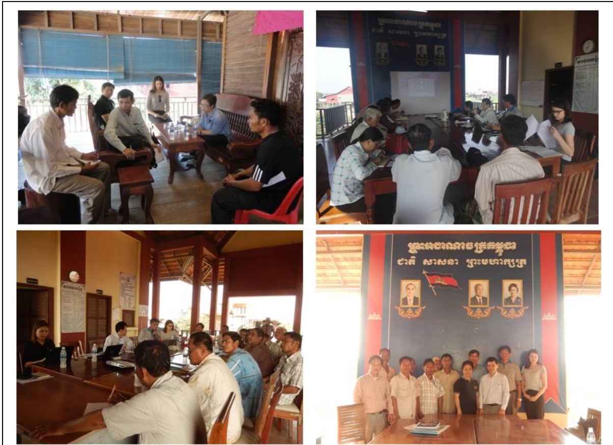
Fig. 3 Meeting with commune's members at Chong Khneas fishing community